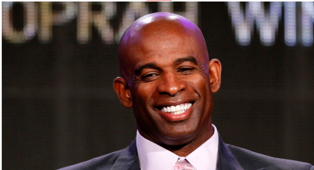
Deion Sanders