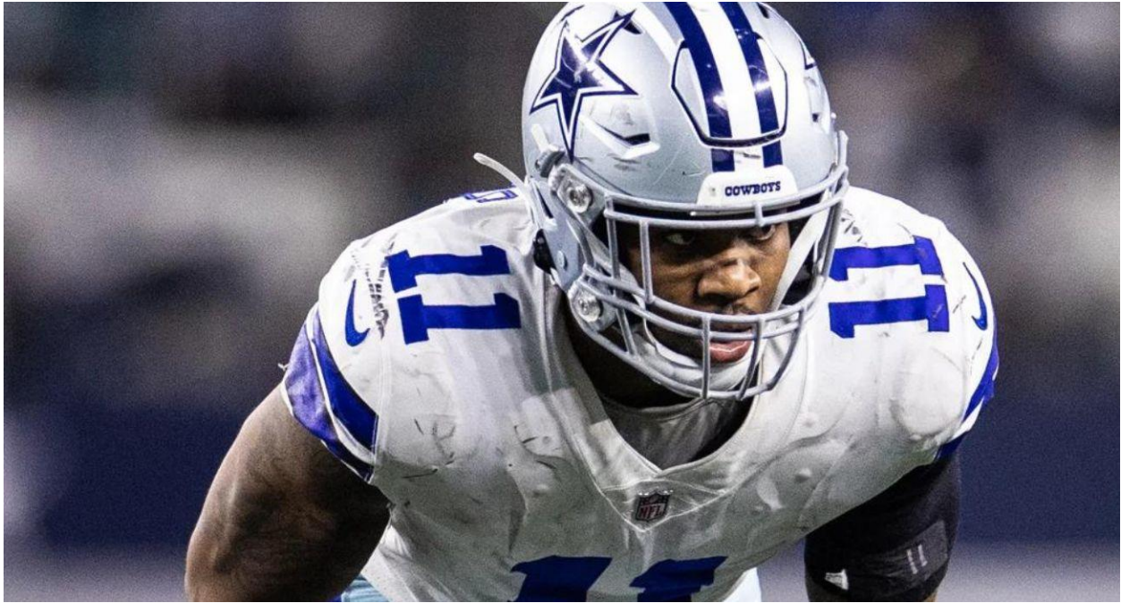
Micah Parsons